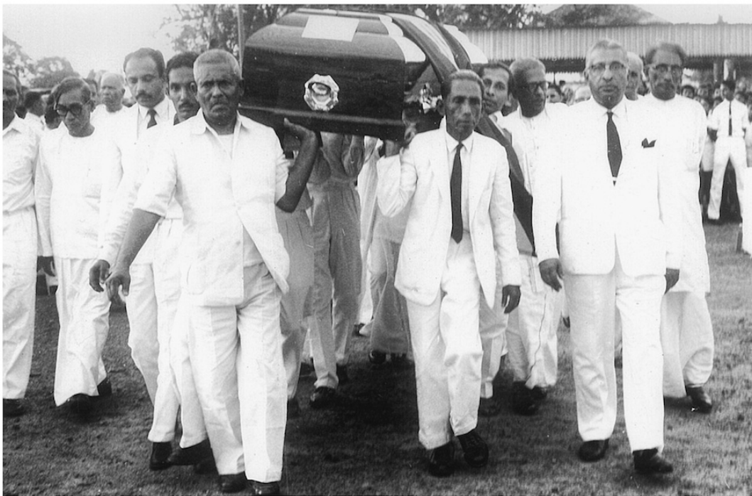
Funeral procession arrives at the cemetery - with Prime Minister Dudley Senanayake and Minister of Education & Cultural Affairs, Mr. I. M. R. A. Iriyagolle.